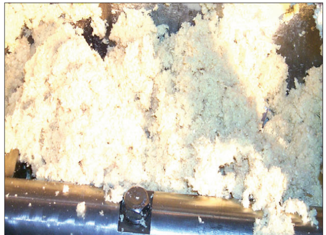
Close-Up of Aramid Fiber After Opening in Processall Mixer