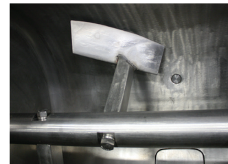
Heat Transfer Plow