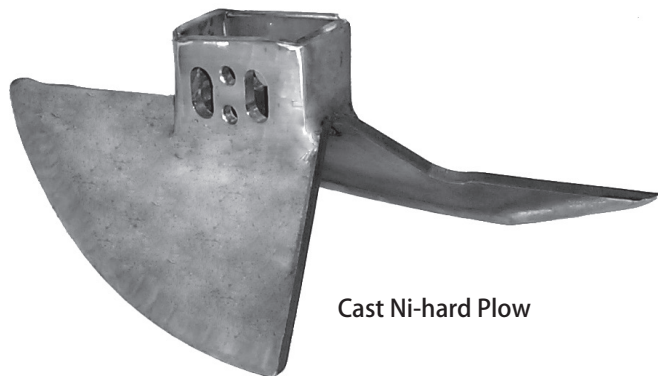
Cast Ni-hard Plow

Shape helps with rolling action during agglomeration, low shear point, reduced power demand