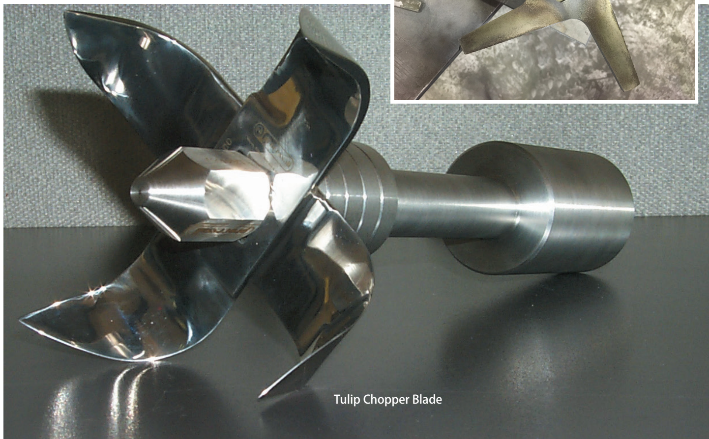
Tulip Chopper Blade