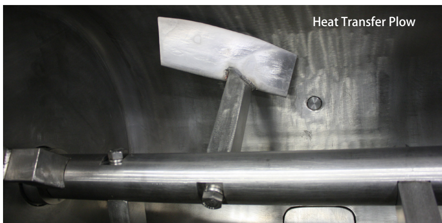
Heat Transfer Plow