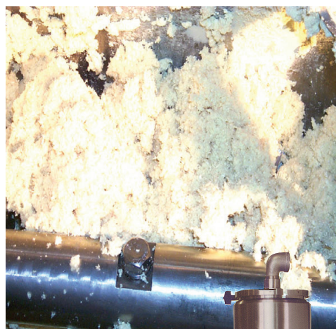
Closeup of Aramid Fiber after opening in Processall Mixer